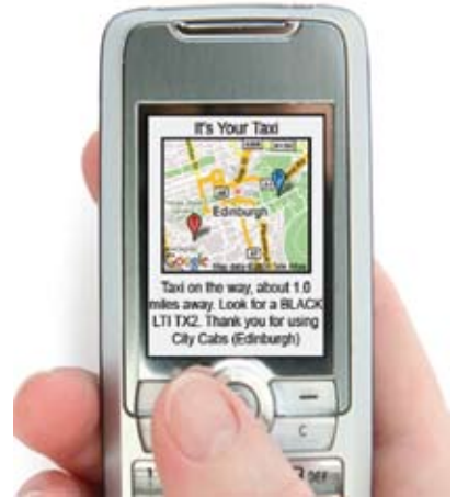
Passenger can track the progress of their vehicle in real-time on a map