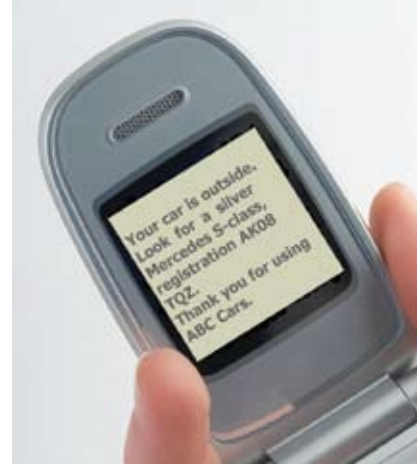
Send text message to passenger when car arrives with vehicle details

See a Live Demo of Web Booker at www.cordic.com