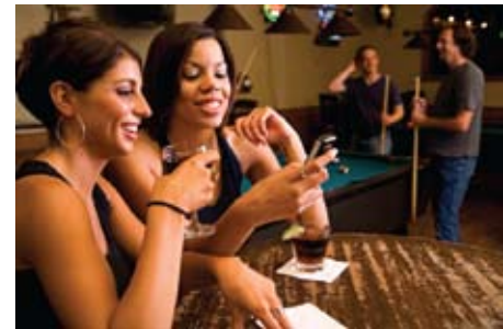
Receive booking confirmation