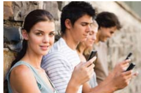
Book your vehicle